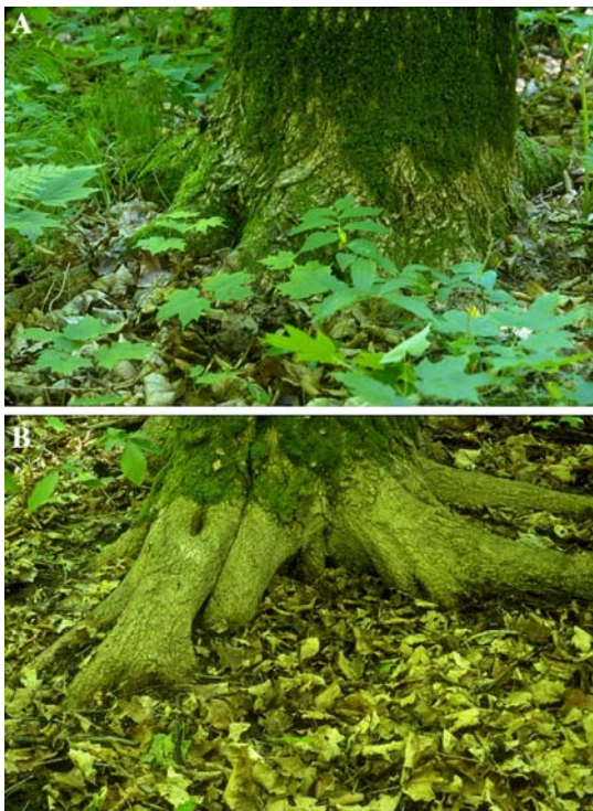
Fig. 2 Forest floor and plant community at base of trees before (a) and after (b) European earthworm invasion in a sugar maple-dominated forest on the Chippewa National Forest, Minnesota, USA.

The rate and magnitude of the removal of the forest floor and the consequences for native forest plant communities depends on the species of earthworms invading (Hale et al. 2005b). The strictly epigeic species, D. octaedra , has a limited effect on forest floor thickness and does not lead to increased plant mortality (Gundale 2002).